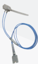
Neonatal Probe PB100