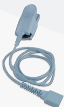
Adult Probe PA100